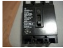
Westinghouse MCP13300R MCP Motor Control 3 Amp MCP13300R (used)

Availability: Usually ships the next business day JA3225W