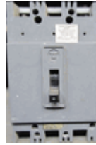
Westinghouse-HFA3050-600-VAC-50-A-3-Pole-Circuit Breaker (used) Westinghouse-HFA3050-600-VAC-50-A-3-Pole-Circuit Breaker (used)

Availability: Usually ships the next business day HFA3050-HFA3050