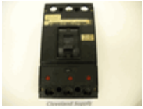
WE Westinghouse JA3225W Adjustable Trip Circuit Breaker 225A 600VAC (USED)

Web: www.aim-sales.com Email: wmrautio@gmail.com