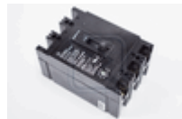
Westinghouse MCP13300R Style: 2606097G25 30AMP Circuit Bre Westinghouse MCP13300R Style: 2606097G25 30AMP Circuit Bre

Availability: Usually ships the next business day HFB2100