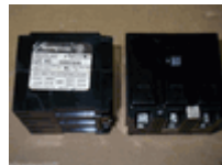
Westinghouse HQNP HQNP3040 HQNP-3040 3 Pole 40 AMP Circuit Breaker (used)

Availability: Usually ships the next business day BQ220220