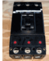
Westinghouse ITE 400 amp circuit breaker LBB3400W (used)

Availability: Usually ships the next business day JL3-F400JL3-T400