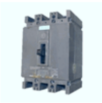
Westinghouse HFB2100 100 Amp 600 Volt 2 Pole Circuit Breaker (used) Westinghouse HFB2100 100 Amp 600 Volt 2 Pole Circuit Breaker

Availability: Usually ships the next business day HFA3050-HFA3050