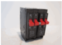
CHALLENGER BRYANT WESTINGHOUSE BQ220220 QUAD 2 POLE 20/20 AMP 120/240 VOLT (new)

Availability: Usually ships the next business day LBB400F