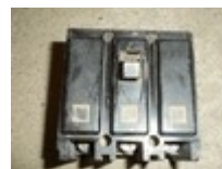
Westinghouse HQNB HQNB3015 3 POLE 15 AMP breaker HQNB3015 (used)

Sale price: $4.50 Availability: Usually ships the next business day BA120