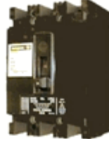
Westinghouse EB3070 Used Circuit Breaker (referbushed) WESTINGHOUSE EB3070 EHB-3070 USED CIRCUIT BREAKER (referbushed)

Availability: Usually ships the next business day HPQ-