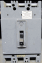
Westinghouse-HFA3050-600-VAC-50-A-3-Pole-Circuit Breaker (used) Westinghouse-HFA3050-600-VAC-50-A-3-Pole-Circuit Breaker (used)

Availability: Usually ships the next business day EHB3100