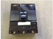
GOULD ITE CIRCUIT BREAKER 400 AMP 600V 3 POLE JL3-F400 JL3-T400 (refurbished)

Availability: Usually ships the next business day MCP13300R