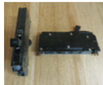
Zinsco Sylvania 15A 15 Amp Single Pole Circuit Breaker Type Q (used) Zinsco Sylvania 15A 15 Amp Single Pole Circuit Breaker Type Q (used)

Availability: Usually ships the next business day R3815