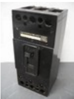
Siemens ITE Circuit Breaker CAT#FJ3B225 225A/600V/3POLE (used) Siemens ITE Circuit Breaker CAT#FJ3B225 225A/600V/3POLE (used)

Availability: Usually ships the next business day FJ3B150