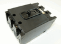
ITE-Siemens 3p 20a 240v Circuit Breaker EE3B020 (refurbished) ITE-Siemens 3p 20a 240v Circuit Breaker EE3B020 (USED)EE3B020 Siemens / ITE / Gould Molded Case

EE3B020 Siemens / ITE / Gould Molded Case EE, 20 Amp, 3 Pole, 240 Volt, Molded Case Circuit Breakers from Siemens / ITE.