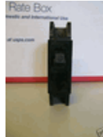
I-T-E CIRCUIT BREAKER 1 POLE 15 AMP EQ 1115

Availability: Usually ships the next business day Q230