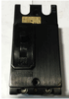
EE2-B040 Siemens ITE Circuit Breaker 2 Pole 40 Amp 240V (used) EE2-B040 Siemens ITE Circuit Breaker 2 Pole 40 Amp 240V (used)

Availability: Usually ships the next business day ED21B100