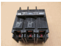
I-T-E BQ BQ3B030 30 AMP 3 POLE 240 VAC Circuit Breaker (new)

Availability: Usually ships the next business day BQ3B020