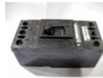
ITE Gould 70 AMP Circuit Breaker FJ3B070-SUB FJ3B070 (used) ITE Gould 70 AMP Circuit Breaker FJ3B070-SUB FJ3B070 (used)

Item Name: FJ3B225 Manufacturer: Siemens Packaged Weight: 12 lb Type: