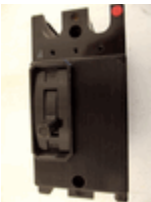
ITE 15A 240V 2P Circuit Breaker ET Frame ET1561 ITE 15A 240V 2P Circuit Breaker ET Frame ET1561

Availability: Usually ships the next business day EE3B020-EE3B020