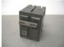
ITE #Q230 30A 2P QP Plug-In Breaker (U) ITE/7 ITE #Q230 30A 2P QP Plug-In Breaker (U) ITE/7

Condition: Used Manufacturer: Siemens/Itte Item: Q230 Plug-In 30A 2 Pole 120/240VAC Type: Qp Good Working Breakers Were Not Load Tested