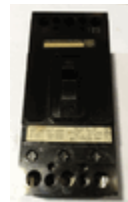
Siemens ITE Type FJ Molded Case FJ3B150 150A EUC (used) Siemens ITE Type FJ Molded Case FJ3B150 150A EUC (used)

Availability: Usually ships the next business day ET1561