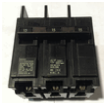
15 Amp, 3 Pole, 240 Volt, Molded Case Circuit Breakers from Siemens / ITE (new)

Availability: Usually ships the next business day BQ3015