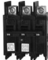
I-T-E BQ3B020 Circuit Breaker,3pole,20a,bq,240v,10ka 3hzv3

Availability: Usually ships the next business day BQ3B015