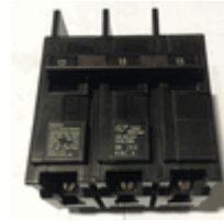
I-T-E ITE BQ BQ3B015 15 AMP 3 POLE 240 VAC CIRCUIT BREAKER (used)

Availability: Usually ships the next business day EE2B040